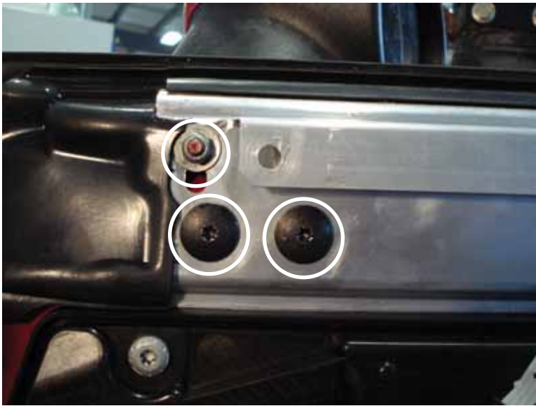
Step 5: Remove the (2) torx head screws and the 10mm nut on the front of the door as shown in the photo above.