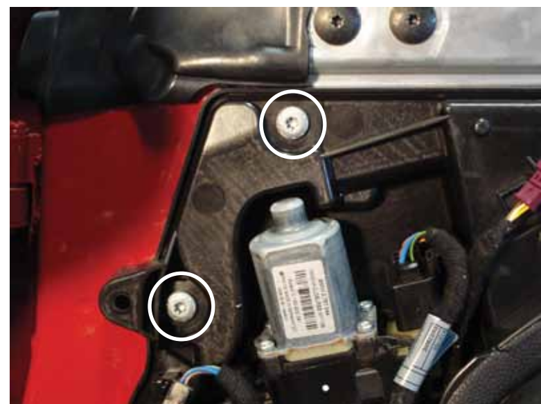
Step 4: Remove the (11) torx head screws located all the way around the door component housing. We have circled 2 of these for you in the photo above.