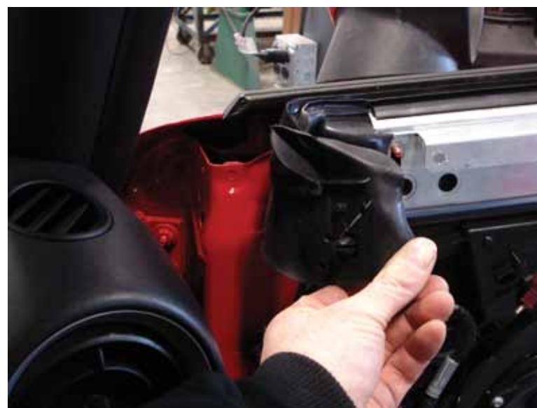
Step 3: Release the rubber boot on the front of door.