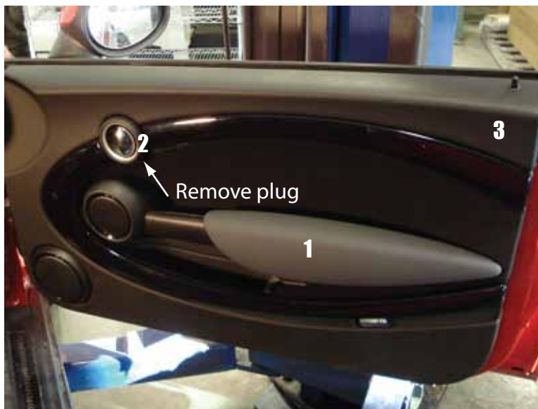
Step 1: Put window in the down position. Using a screw driver with tape wrapped around the tip, carefully pry off, (1) armrest, (2) handle surround (remove small plug at bottom) and the (3) main door card. See photo for locations. Don't be afraid, they do all just pull off.

For an installation video of this product, go to www.rennline.com and search for P/N DH24, then click the video link.