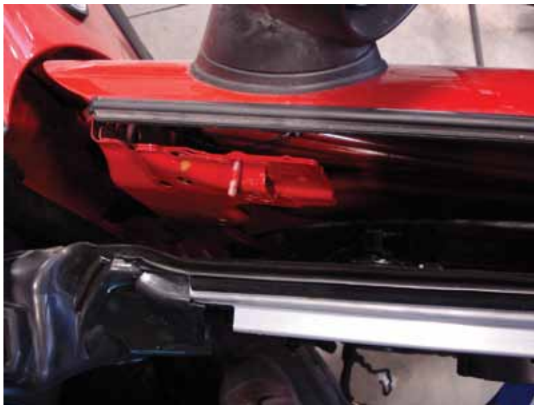
Step 7: The door component housing should now be free from the door frame. Lift assembly up a bit and pull the front of the assembly away from the door about 2 inches as shown in photo above.