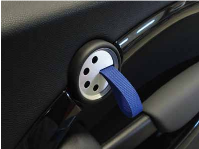
Step 13: Now do everything that you did in steps 1-12 in reverse. When you get to the door handle surround, insert the Renline handle cover prior to installing it, as shown above. Now move to the other side of the car.