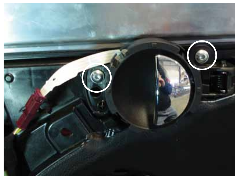
Step 10: Remove the (2) torx head screws from the interior handle assembly and remove it from the component housing.