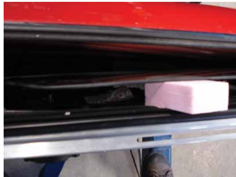
Step 8: Wedge a piece of foam board (or equivalent) between the window glass and the component housing. This will allow you to release the cable from the back side of the interior door handle.