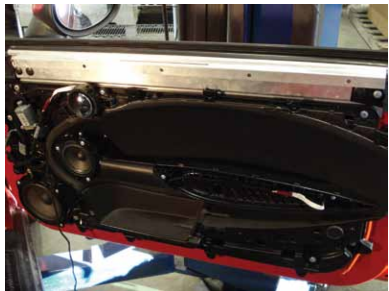
Step 2: Your door should now look like this.