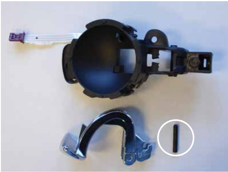
Step 11: Remove the handle pin and the handle from the assembly as shown in photo.