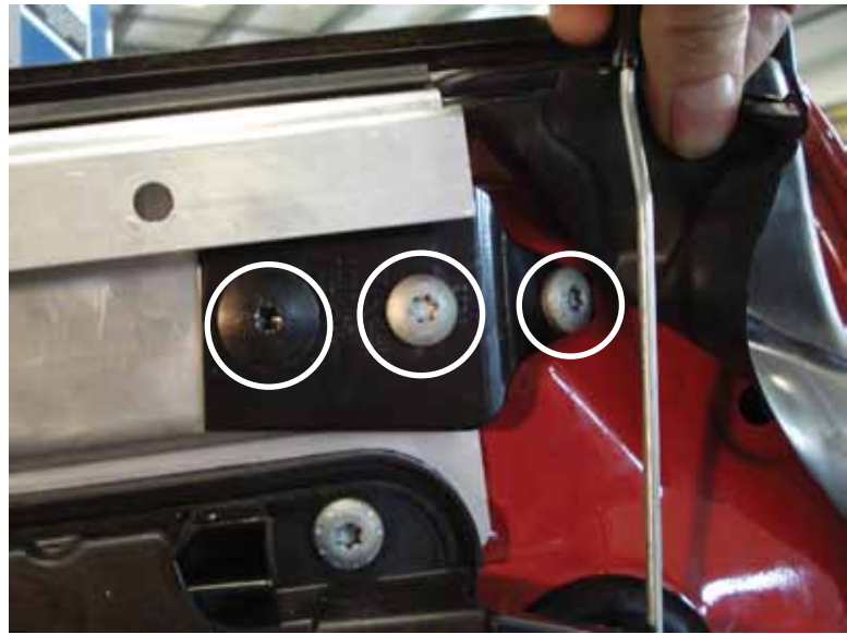
Step 6: Remove the (3) torx head screws and bracket on the rear of the door as shown in photo above.