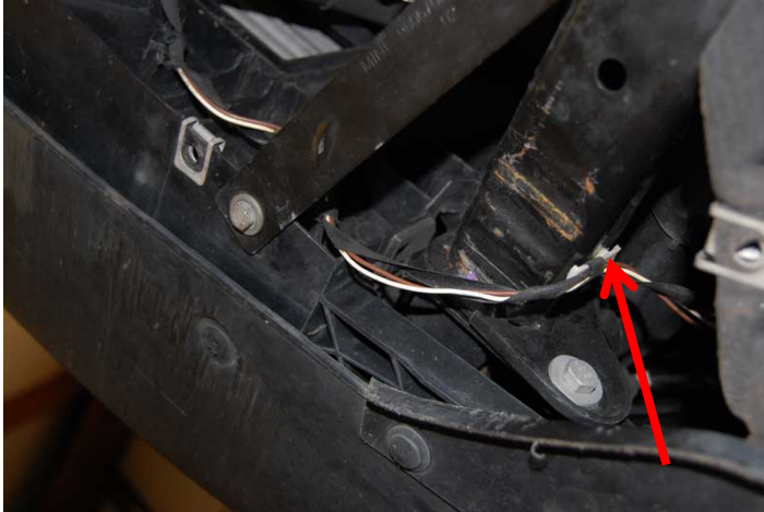
Figure 3: Wire Clip-Right Side of Car

3. Locate the wires clipped to the right side outer frame rail. Using a screw driver or side cutters remove the clip from the frame rail. It is a plastic christmas tree style clip and can easily be removed. See Figure #3