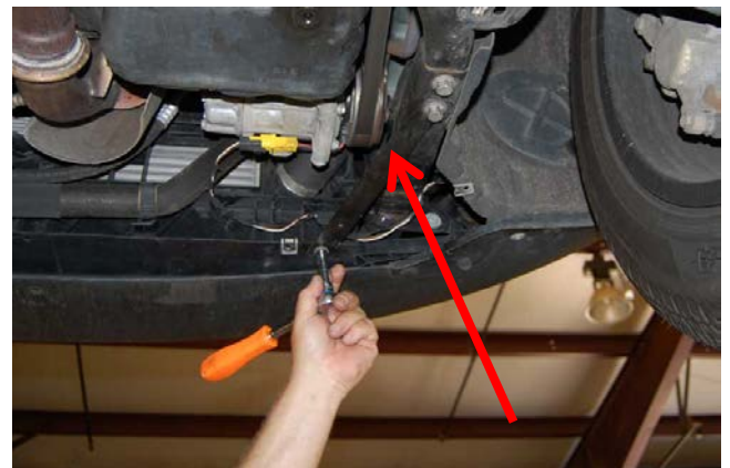
Figure 4: Support Strap

4. Remove the two 1" x 12" support straps by removing the two 5/8" [16mm] frame connector bolts and the front two 10mm screws. Reinstall the large bolts removed from the rear and torque to 80 ft-lbs (110 Nm) each. Reserve the brackets and 10mm bolts for a later use. See Figure #4