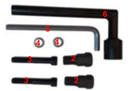
Utility Hitch Hardware Kit 90-1040