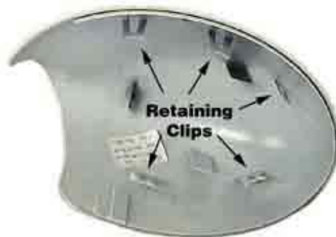
Passenger Side (LHD)

A close-up of the clip is pictured below.