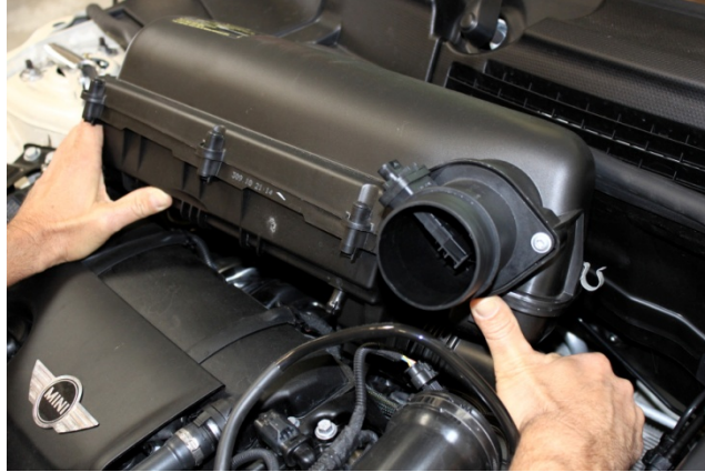
5. Locate fresh air pipe that is attached to air filter box. Disconnect fresh air pipe by rotating the 90° connection counter clockwise and pulling pipe away from air filter box. Remove air filter box from vehicle.