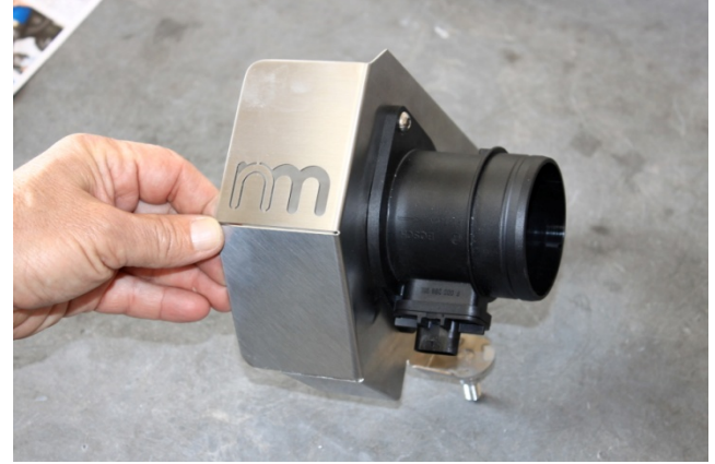
7. Install MAF sensor to NM stainless steel intake pipe bracket using supplied M6 x 16mm button head bolts and M6 nuts. [4mm hex key wrench / 10mm socket or wrench]