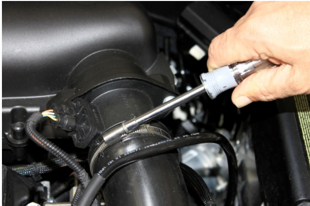
1. Loosen hose clamp at Mass Air Flow sensor (MAF) to turbo intake tube using 7mm nut driver or screwdriver.