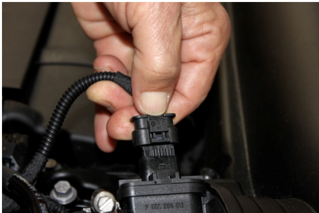
2. Squeeze tab on electrical connector to disconnect from MAF.