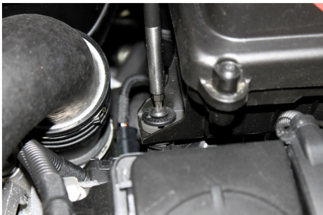
4. Remove T25 TORX screw located on passenger side of air filter box and lift off. NOTE: There are [3] pin mounts that are pushed into rubber grommet mounts on intake manifold, so effort may be required to lift air filter box off of mounts.