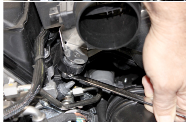
8. Install NM SS bracket onto factory air filter box mounts. NOTE: Make sure rubber grommets are still in place and not attached to bottom of the OE air filter box. From bottom side of mounts, install and tighten using supplied M8 washers and M8 lock nuts. [13mm wrench]