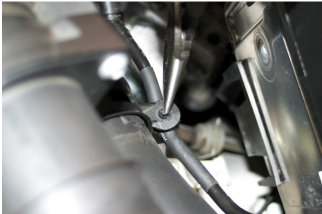
3. Separate brake booster line holder from fresh air intake hose. Use needle nose pliers to squeeze tabs and then push out holder.