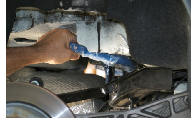
Install NM anti-roll bar in reverse of removal of original bar. HINT: Leave plastic wrap on bar to protect finish of bar during installation thru sub-frame then remove.