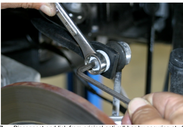
Disconnect end-link from original anti-roll bar by securing stud with 6mm hex key wrench and loosening nut with 16mm wrench. Repeat for other side