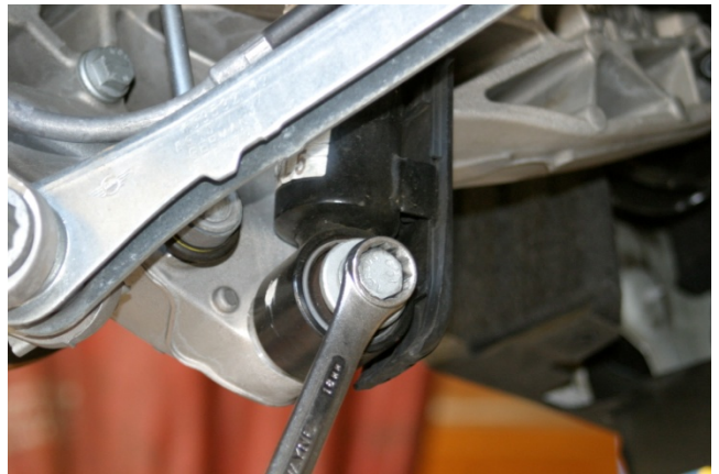
Unbolt and remove lower shock absorber bolt using 18mm wrench