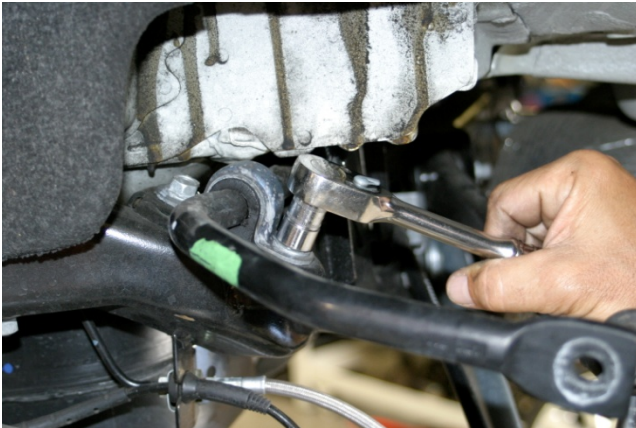
Remove the bushing clamp mounting bolts [2] using a 13mm socket. Remove clamp and bushing. Repeat for other side.