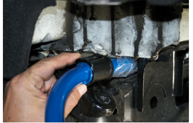
Apply supplied grease to inside of supplied bushings and install on the inside of stop washer on NM anti-roll bar.