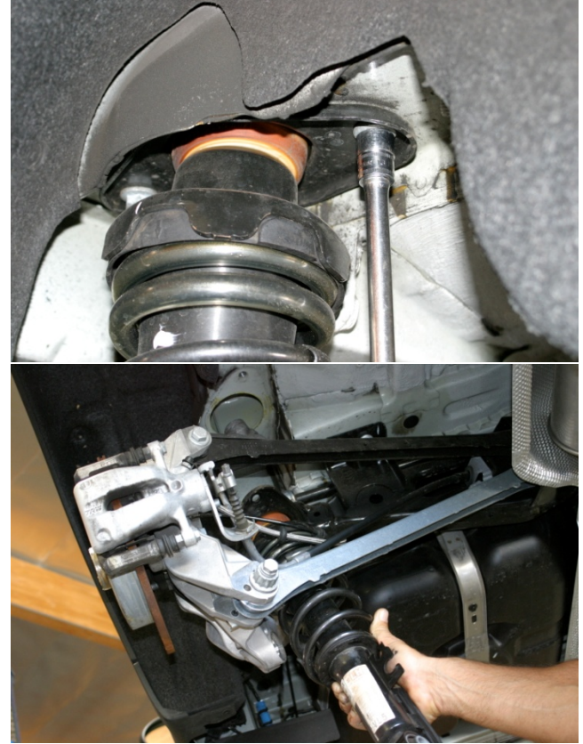
Unbolt and remove [2] upper shock mount bolts using 13mm socket and 18" extension. Remove shock and repeat for other