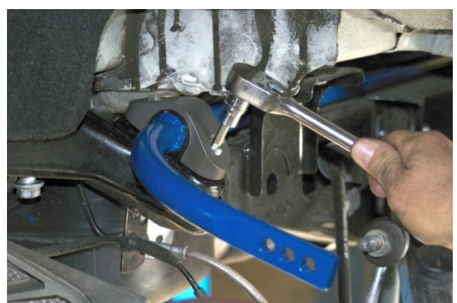
Install billet aluminum clamps over bushings and bolt to subframe using supplied M8 x 25mm bolts. Torque to 33 Nm (25 ff-lbs)