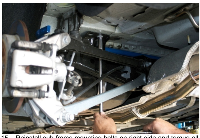
Reinstall sub-frame mounting bolts on right-side and torque all [4] bolts to 100 Nm (74 ft-lbs).

16. Install rear shocks in reverse of disassembly. Torque top shock mount bolts to 56 Nm (41 ft-lbs) and torque lower shock mount bolt to 165 Nm (121 ft-lbs). Reattach brake line and ABS wire on each side.