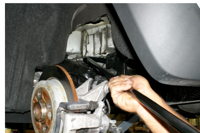
11. Now from left-side of vehicle completely remove original bar.