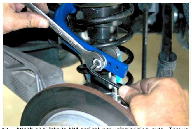
Attach end links to NM anti-roll bar using original nuts. Torque to 30 Nm (22 ft-lbs). See adjustment chart for hole mounting information.

16. Install rear shocks in reverse of disassembly. Torque top shock mount bolts to 56 Nm (41 ft-lbs) and torque lower shock mount bolt to 165 Nm (121 ft-lbs). Reattach brake line and ABS wire on each side.