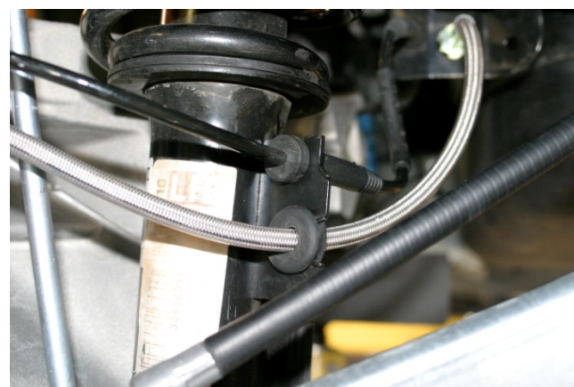
Detach brake line and ABS wire from rear shock absorbers.

Using the manufacturer's recommended lifting points, raise rear of vehicle and support with jack stands. Remove rear WARNING: NEVER WORK UNDER A VEHICLE SUPPORTED ONLY WITH A JACK - SERIOUS INJURY OR DEATH CAN OCCUR!