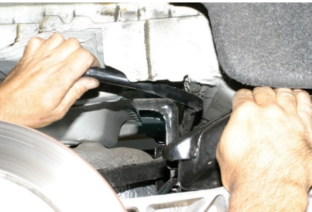
10. From right-side of vehicle, push out original anti-sway toward left-side of vehicle between uni-body and sub-frame.