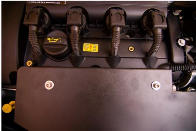
Figure 4-Installed on N14B16A Engine

If you have any questions or concerns, don't hesitate to call our office Monday – Friday, 9am—4pm EST or e-mail us techsupport@m7tuning.com .