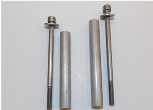
Figure 3-Hardware Kit

4. If available, place a small amount of high temperature anti-seize or copper slip on the threads of the bolts.