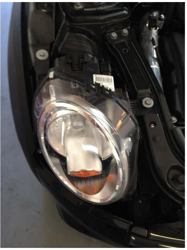
Figure 4 Head light bolt locations

6. Remove the radiator core support starting with the hood locks and plastic grill clips.