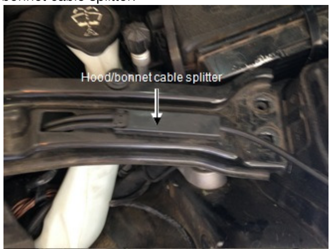
Figure 6 Cable Splitter Box

7. Remove the Hood/bonnet cable splitter.