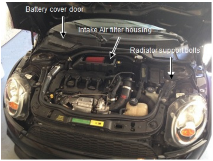
Figure 1 Mini Cooper engine Bay

1. Open the hood then the battery cover door and disconnect the negative battery terminal.