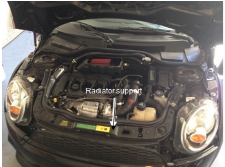
Figure 8 Radiator Support

10. Disconnect the lower boost tube from the Intercooler.