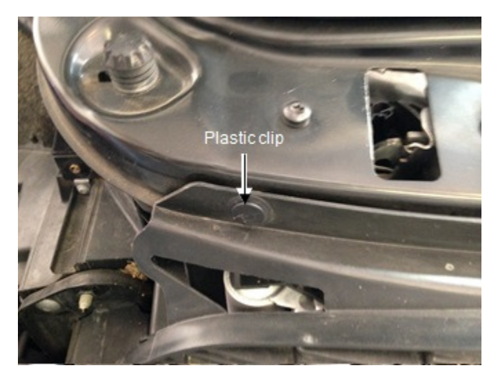
Figure 5 Grill Mounting

6. Remove the radiator core support starting with the hood locks and plastic grill clips.