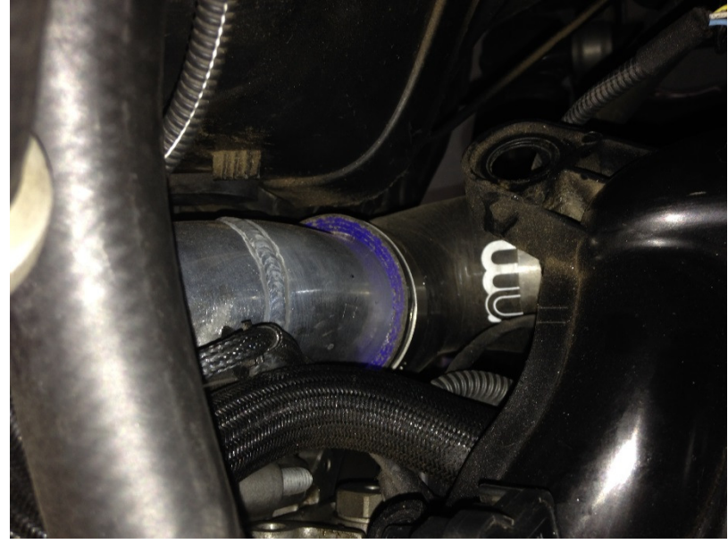
Figure 10 Intake Manifold Elbow

12. Remove nut-sert (nut insert) using increasing sizes of drills until the compression portion of the nut separates.