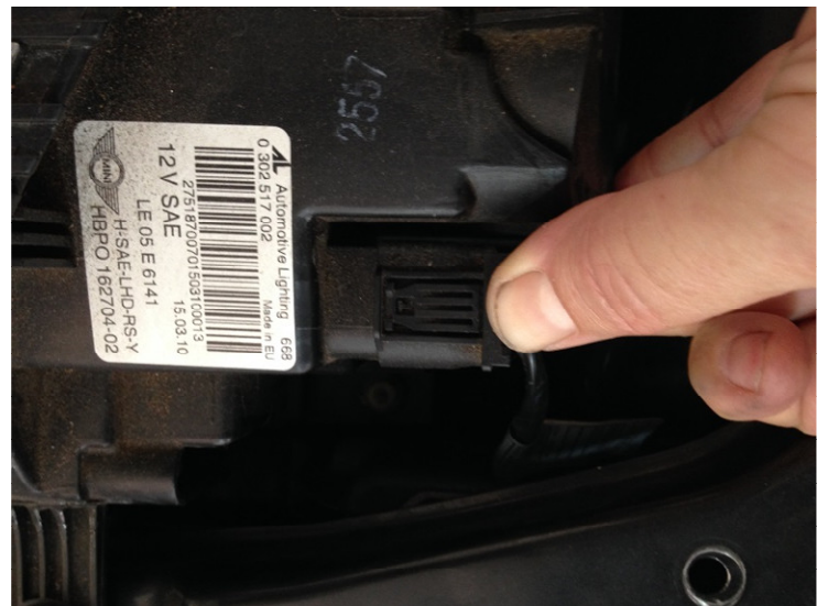
Figure 3 Head light electrical connection

4. Remove the electrical connector on the head light by squeezing the tabs on each side of the connection.