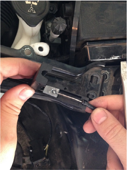
Figure 7 Cable Splitter

8. Open the cover and disconnect the cables.