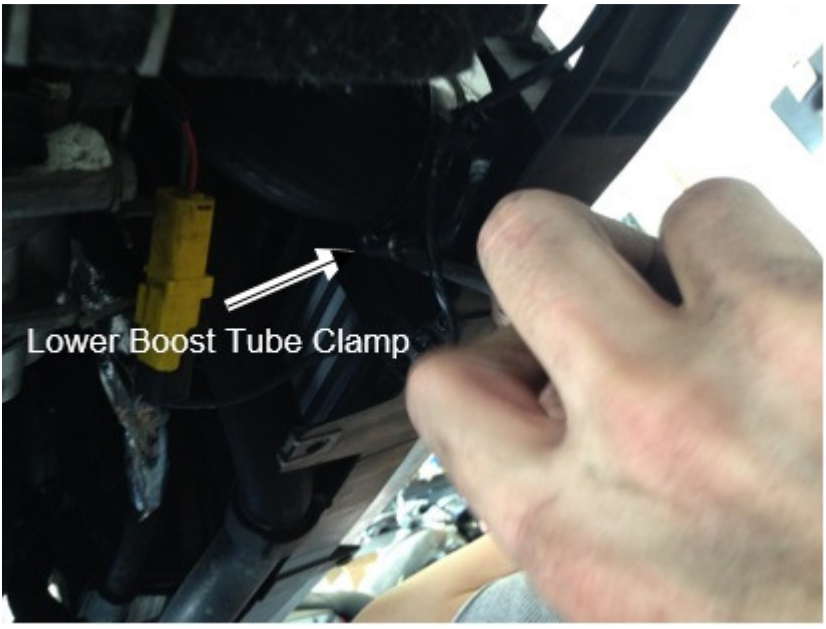
Figure 9 Radiator Support

10. Disconnect the lower boost tube from the Intercooler.