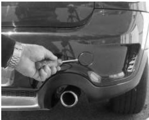
Steps 1 & 2