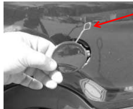
Bumper Access Cover Retaining Hook