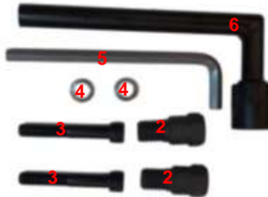
Utility Hitch Hardware Kit 90-1040