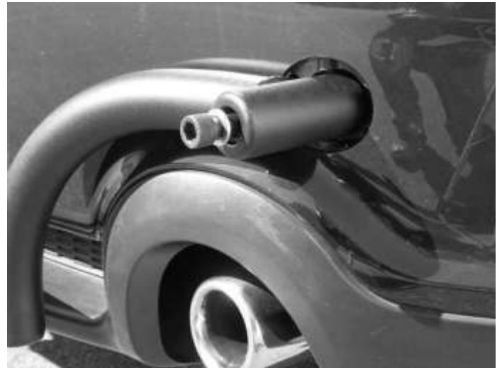
Step #5 & #6