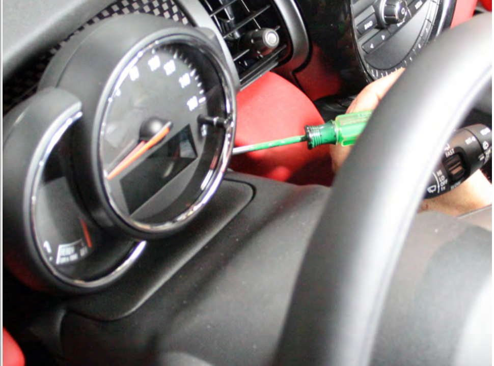
2. Pull the gauge cluster towards you and depress the lock-tab to remove the electrical plug from the rear of the unit.